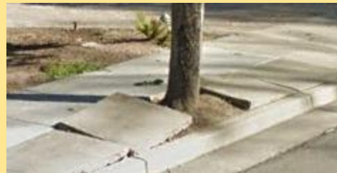
High root tripping hazard